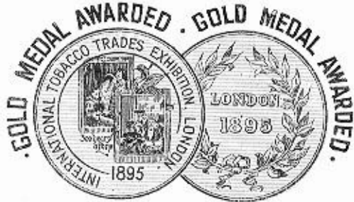
BEST FINISHED PIPE

However, for those who have not gone deeply into the matter, we append a few explanations.