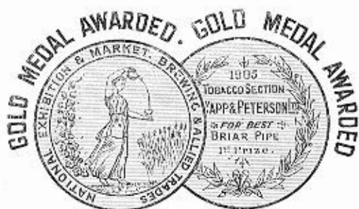
BEST FINISHED PIPE

liquid commonly called nicotine is only saliva and condensed moisture, mixed with a residue of essential oil of tobacco which is deposited by the smoke.