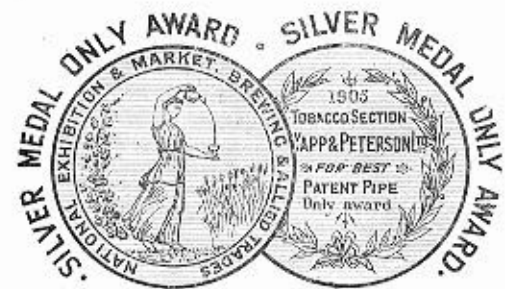
BEST PATENT PIPE.