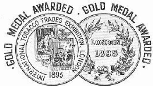
BEST PATENT PIPE.

Smokers as well as Pipe manufacturers, have hitherto misunderstood saliva for nicotine. There is no nicotine in a pipeful of tobacco, or rather it is so small that it would be impossible to extract it. The brown